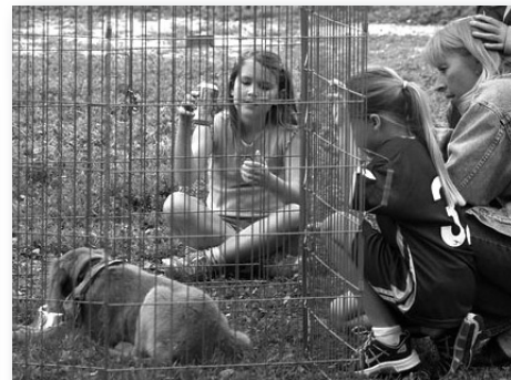
The foster pup in crate draws the attention of picnic goers.